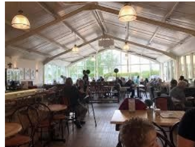
Serving home-made food for your customers

Apart from browsing the garden centre, your customers can make themselves at home in the warm, friendly café while waiting for their valet to be completed..... no need to stand outside in the cold !