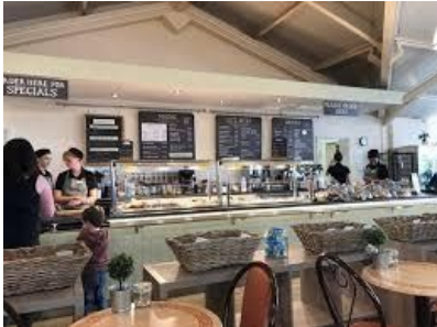
With a lovely cafe